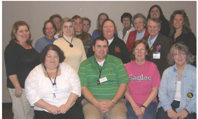
These officers and building representatives pictured above attended the February DCAE meeting at Memphis Pizza Café.